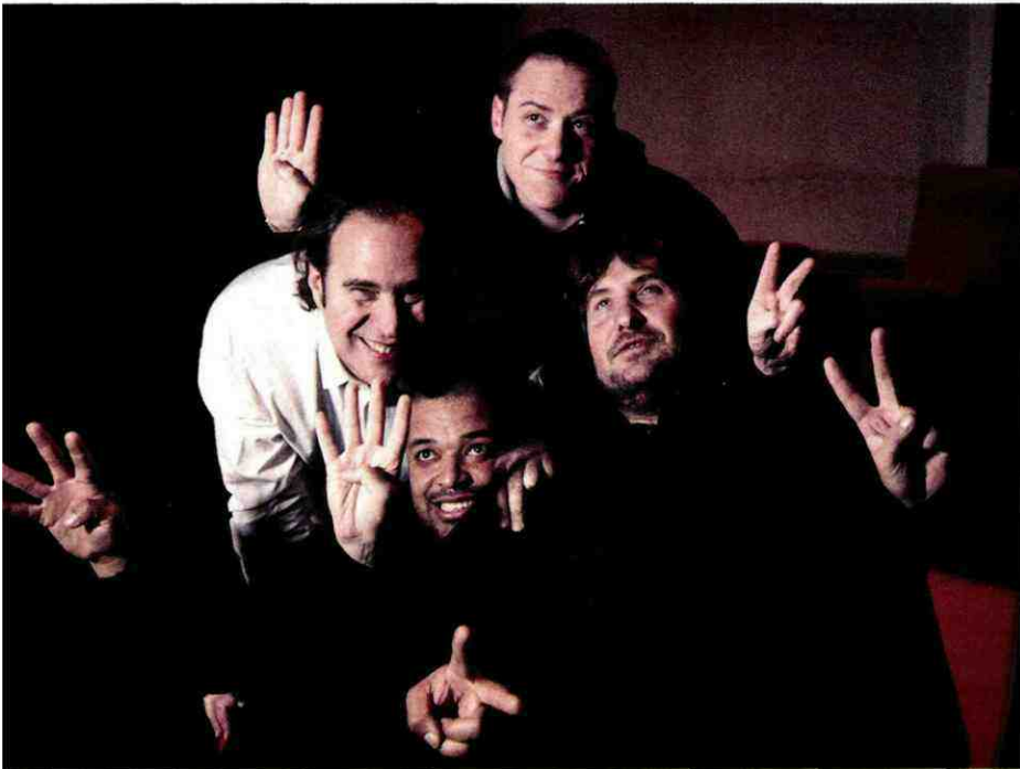
Niel and his 42 co-founders, who hold up four fingers on one hand and two on the other.