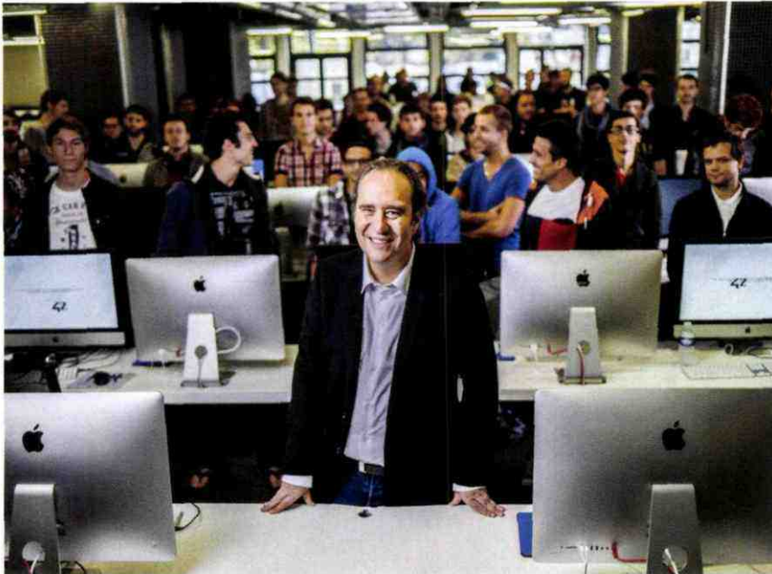
Niel, photographed with some of his students

“There’s a lack of social mobility. If you are the son of a doctor, you will be a doctor.” —Xavier Niel, CEO and founder, Iliad